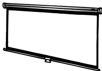
Model B® - 16:10 Wide Format

*92" Diagonal sizes include 18" total black drop at top. 106" Diagonal sizes include 12" total black drop at top.