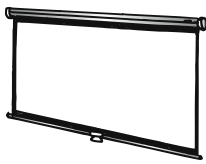
Model B® - HDTV Format