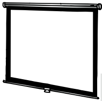
Model B® - Video Format