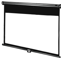
Model B® - HDTV Format